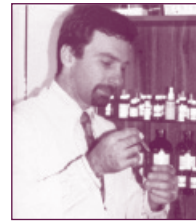
Preparation of Aromatherapy Essential Oil blends